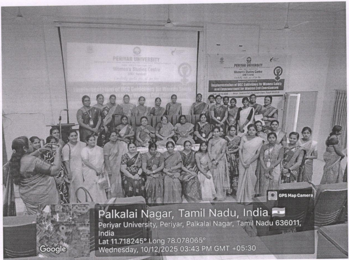
Awareness program on Implementations of UGC guidelines for Women safety and Empowerment for Women Cell Coordinators conducted by Women Studies Centre, Periyar University.